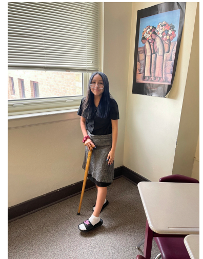
“Old Timers Day”

Greeley Central's student council collected a series of fun themes for the students to dress up for during the entire week of homecoming.